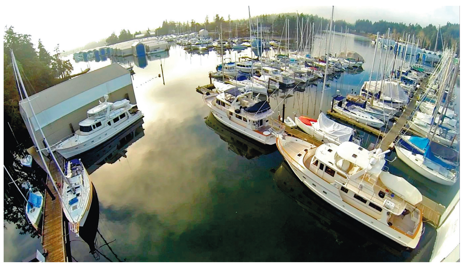
Operating out of the Westport Marina the company works on both sail and powered recreational vessels