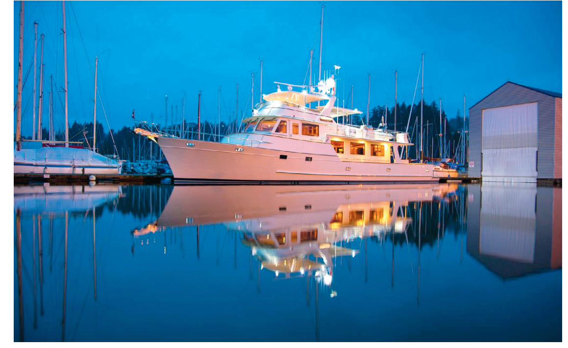
Delta Marine will send technicians anywhere in the world to work on Fleming Yachts, as they are the authorized service centre